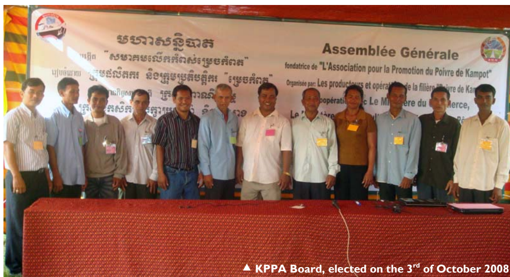
▲ KPPA Board, elected on the 3 rd of October 2008

After approximately seven or eight months of work (simultaneously on the by-laws of association and GI specifications), the draft by-laws of association for the two GI organizations were approved by their respective General Assemblies (in October 2008 for KPPA, and November 2008 for KSPA).