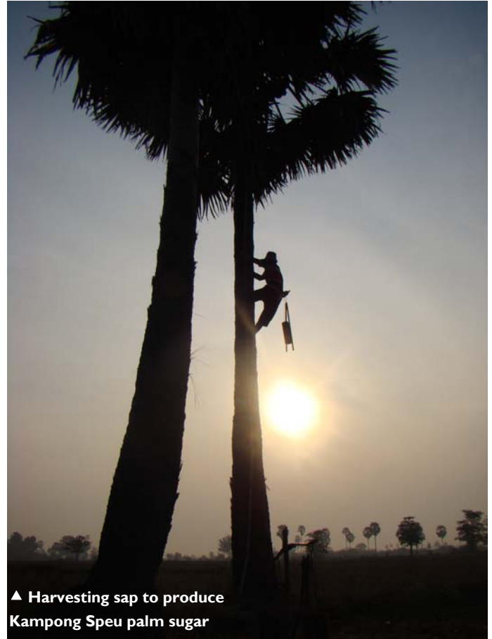
▲ Harvesting sap to produce Kampong Speu palm sugar

H.E. Chan Sarun, Minister of Agriculture, Forestry and Fishery