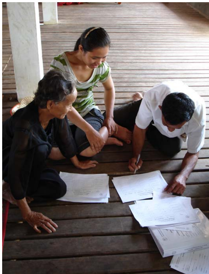
▲ Training Kampot pepper producers in recording “matter accounting” (recording pepper production and sales under the GI) .

traders), who signed a promise to comply with the specifications. With the support of the project team and international experts, tools were proposed to ensure traceability and control. Each operator in the respective commodity chains received a binder containing the specifications, the association's by-laws and his or her membership certificate. The binders are also used to record his or her production and sales (see the article on the following page on the control system).