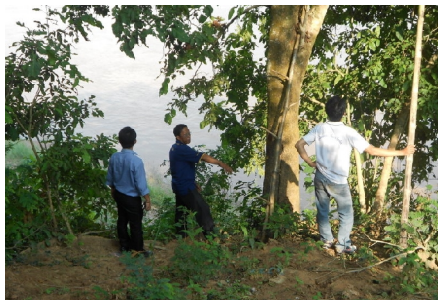
Pakfong: Inspection of a potential location of the intake along the Mekong river

Feasibility studies of Nonesavanh, MeuangPa and Pakfang were completed and results shared with the local authorities in November and December. All feasibility studies (7 are remaining) will be completed in the coming months before the end of the dry season.