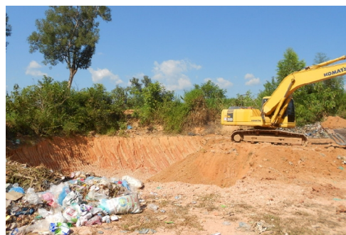
Excavator in action in Thabok landfill