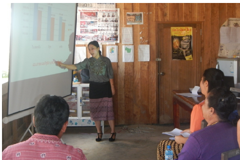
Sharing of feasibility study results in Nonesavanh

In November, the first community trainings session were organized in the four target villages to present to the population the construction phases and the financial and economic aspects of the water service. Hygiene and health messages were also disseminated by the trainers.