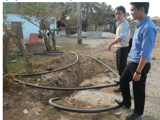
NPNL and MADEVIE team visiting Pak Ngum site