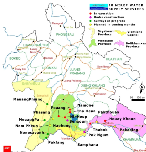
Location of Mirep sites

Two concessionaires are selected, for MeuangPa and Nonesavanh sites. A quicker concessionaire selection process was successfully tested.