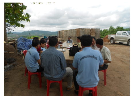
Meeting of the construction monitoring committee in MeuangPhieng

Mirep 3 is funded by the Syndicat des Eaux d'Iles de France ( SEDIF ), the Agence de l'Eau Seine Normandie ( AESN ), Aquassistance , provincial authorities and local entrepreneurs.