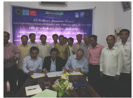
Signature of Napheng concession and subsidy contracts in Vientiane province