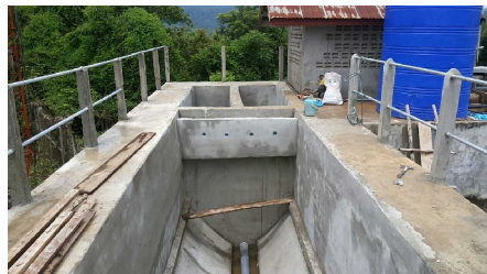
The sedimentation tank in Hinheup