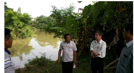
Identification of the new water source in Nonesavanh, Vientiane Province