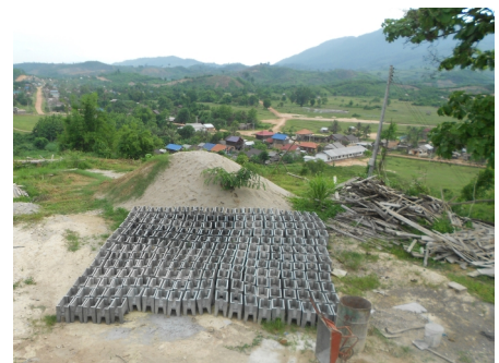
Water meter boxes ready to be installed in MeuangPa