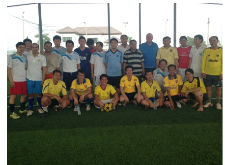
Water Supply Regulatory Office (WASRO) 7 - 6 Gret