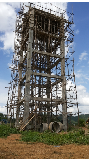
Pakfang water tower

• The construction of Pakfang site is also progressing at a good pace. Three options are being considered for the power supply to the treatment plant, connection to the national grid, a diesel generator or a photovoltaic system. The concessionaire will choose based on the investment.