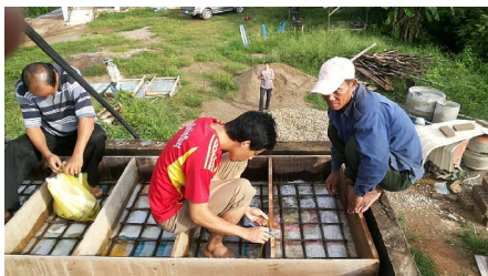
Preparation of the sand filter bottom slab in Hinheup