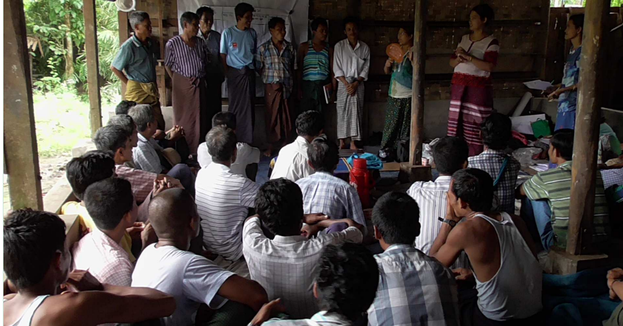
HP cluster assembly for committee members selection

In order to deliver these financial services, GRET with the members selected a decentralized organizational model which is cost and time efficient, based on a strong sense of ownership by the members, and allowing a demand-driven development of the products. Village-based credit committees are composed of villagers elected, and are responsible of credit assessments, clients selection, approvals and repayments. In addition, by being members they take part of strategic, institutional and operational decisions in order to improve the quality of the services. GRET is responsible of the emergence of committees, build their capacity, granting initial seed capital, and direct support to the monitoring of the financial management, and to facilitate the structuring of democratic governance.