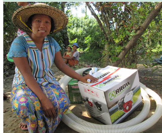
Engine delivery to the lessee, future owner (HP)