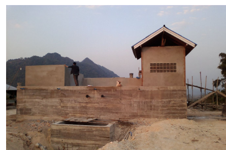
The water treatment plant of MeuangPa