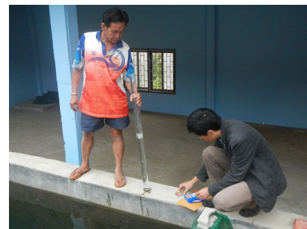
Water quality testing by Senxoum operator