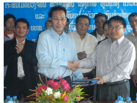
Concession and subsidy contracts signature in Meuang-Phiang

Map of the Mirep sanitation and hygiene activities