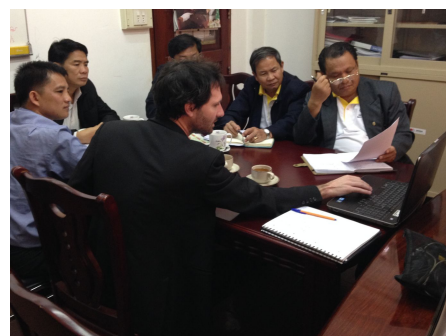
Working session with Wasro on the monitoring and evaluation programme of water services performances