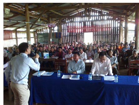
Community training in MeuangPhieng site in November

Mirep 3 is funded by the Syndicat des Eaux d'Iles de France (SEDIF), the Agence de l'Eau Seine Normandie (AESN), Aquassistance , provincial authorities and local entrepreneurs.