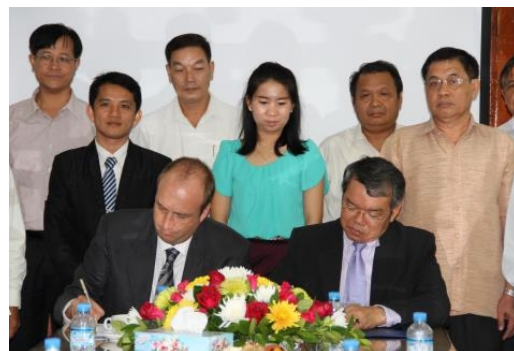
Signature of the MoU of Mirep 3rd phase between Gret and the DHUP, on September the 17 th

Mirep 3 is funded by the Syndicat des Eaux d'Iles de France (SEDIF), the Agence de l'Eau Seine Normandie (AESN), Aquassistance , provincial authorities and local entrepreneurs .