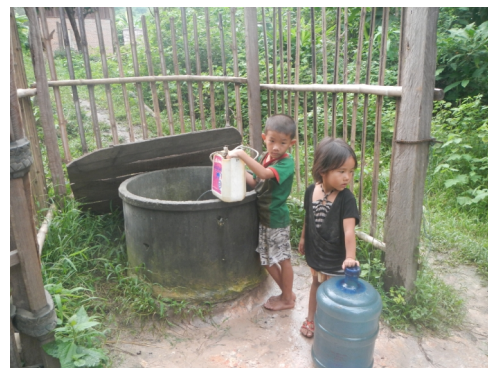
Private well used by several families in Meuang Phieng

• Namone concessionaire has changed the defected water production meter and installed a depth gauge in the water tank. The concessionaire has to improve the functioning of the raw water intake in the river.