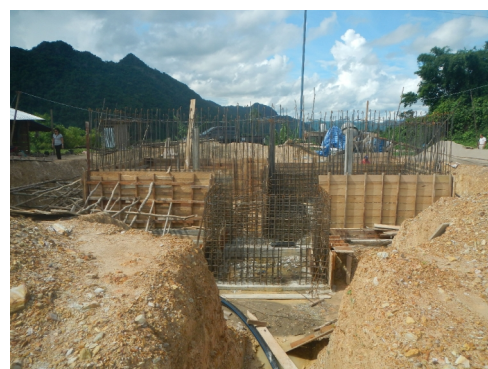
Water tank construction —Meuang Pa Site