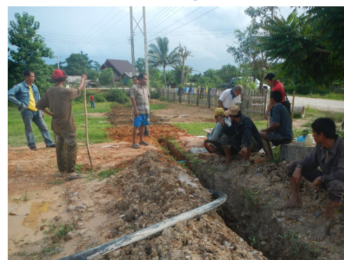
Laying of pipes —Meuang Pa Site