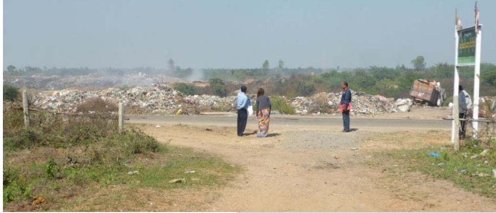
The landfill of Magway city

Regarding solid waste management, the project aims to improve the primary collection of domestic waste in a central zone of the city, to optimise collection procedures at city scale and to build a composting unit for market waste.