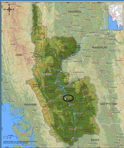
Location of Magway City