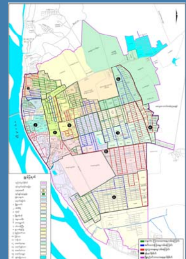
Waste collection zones