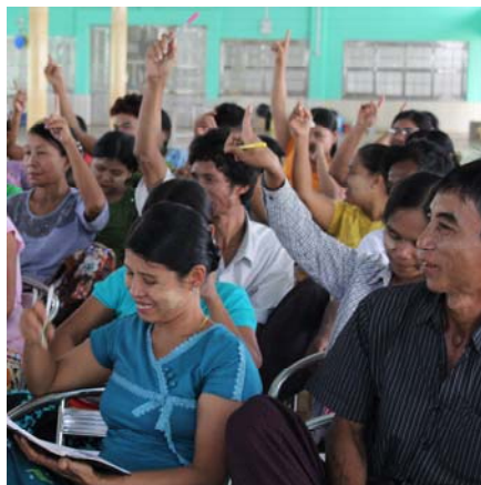
Producers Organization Workshop