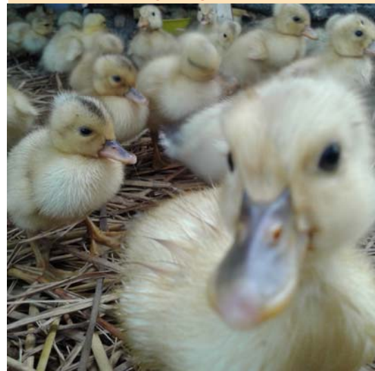
Ducklings management Demo Farm