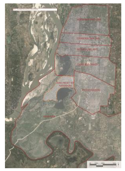
Mandalay City and the project zone

Located in the South of the City, Amarapura is the largest Township of Mandalay City. Most of it is rural except its north-western part, composed of 9 urban wards encompassing many religious buildings and touristic places such as the famous U Bien Bridge. Its location and its recent incorporation within the service area of the MCDC, in 2011, make it one of the most under-served area of Mandalay City and the MCDC therefore selected it to test improvement measures to enhance the quality of the water service.