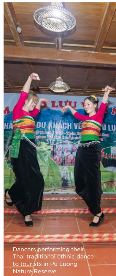
Dancers performing their Thai traditional ethnic dance to tourists in Pu Luong Nature Reserve.

“ We are proud to be celebrating 35 years contributing to the development of different sectors in Vietnam since our establishment in 1988. GRET's areas of intervention have changed in line with the socio-economic development of the country. In the 1990s and 2000s, GRET projects in Vietnam focused on agriculture, nutrition, and microfinance. Currently GRET is prioritizing digitalization, the circular economy and labour rights. In all sectors, we continue to have a high commitment to innovation and sustainability.” ”