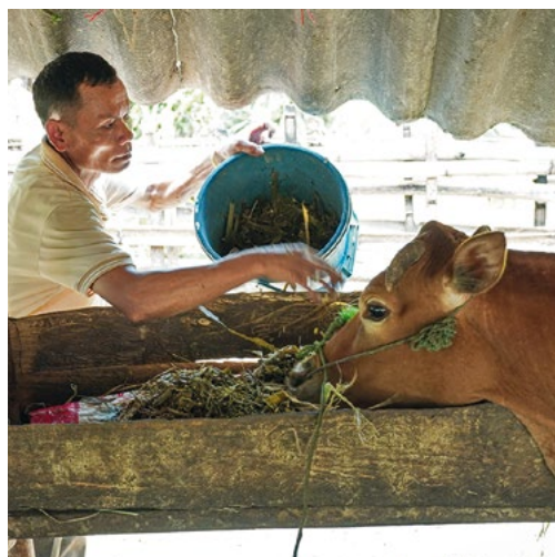
A farmer feeding his cow with silage, a special food made of fermented fresh forage introduced by ASSET, in Dien Bien, Vietnam.