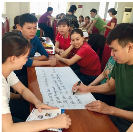
Core workers at one of their regular meetings as part of the Phu Nu project in Vinh Phuc province.

The Agroecology and Safe Food System Transitions (ASSET) Project aims to transform food and agricultural systems in Southeast Asia to make them more sustainable, safer and inclusive, by harnessing the potential of Agroecology. Implemented across three countries, including Vietnam, ASSET activities are being conducted via impact-oriented stakeholder engagement in agroecology and safe food system transitions, and upscaling of agroecological and safe food innovations from local to regional levels.