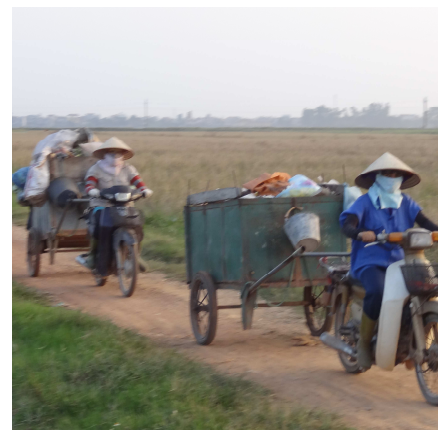
Waste collectors in Vinh Phuk

Gret and its local partners, SDPE (Department of Ministry of Natural Resources and Environment), Cooperative Alliance, Song Hong Center and Institute of Water and Environment, jointly developed the project and created a Project management Unit to define strategic orientations and implement activities.