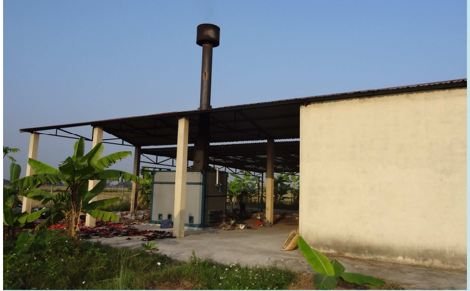
Pilot incinerator operating in Vinh Phuk province (oct 13)