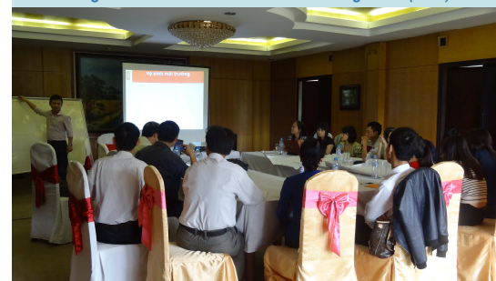
Training of local NGOs on Solid waste management (2013)